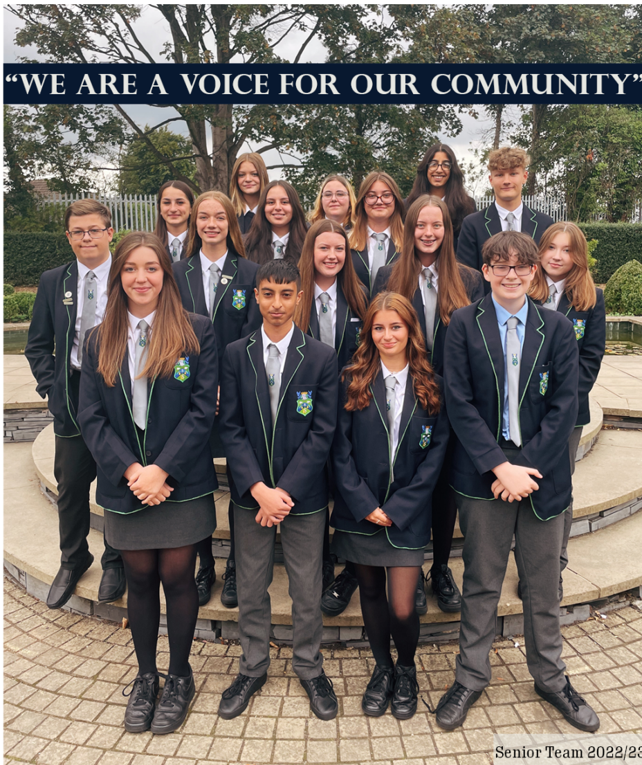
Senior Team 2022/23