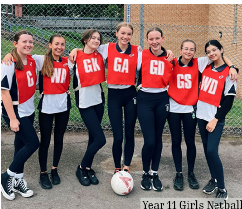
Year 11 Girls Netball