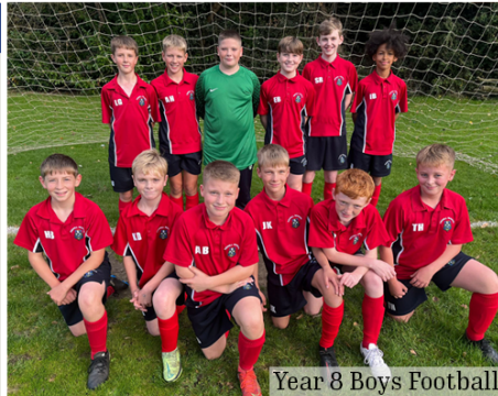
Year 8 Boys Football

The Year 7 & 8 Boys Football Teams have begun training and matches this term, both triumphing over Pedmore. Both teams have developed their performances incredibly well, working well as a team and improving each week. Some fantastic play!