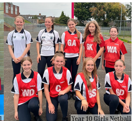
Year 10 Girls Netball