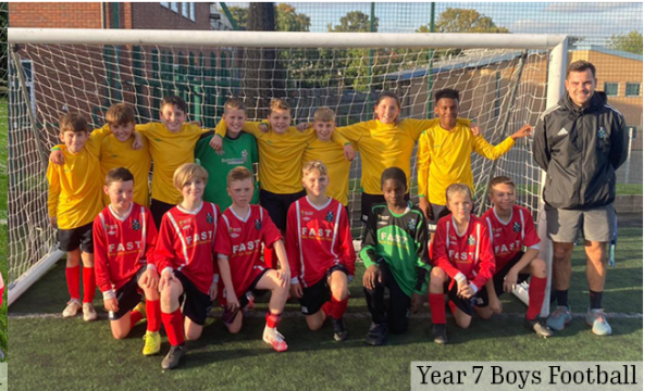
Year 7 Boys Football