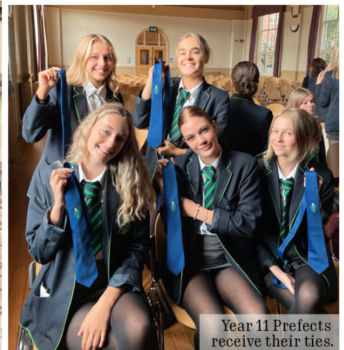
Year 11 Prefects receive their ties.