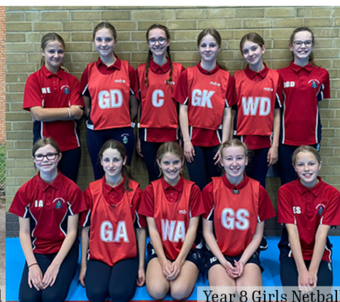
Year 8 Girls Netball